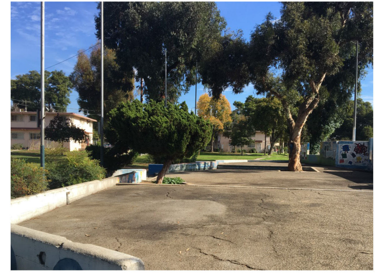
Old concrete and asphalt