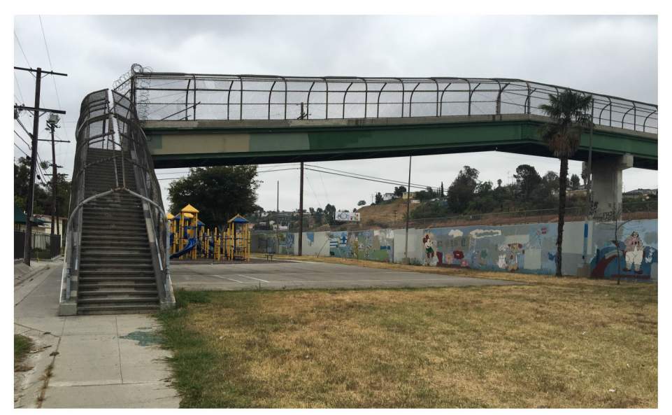
Center of project site & pedestrian bridge over freeway