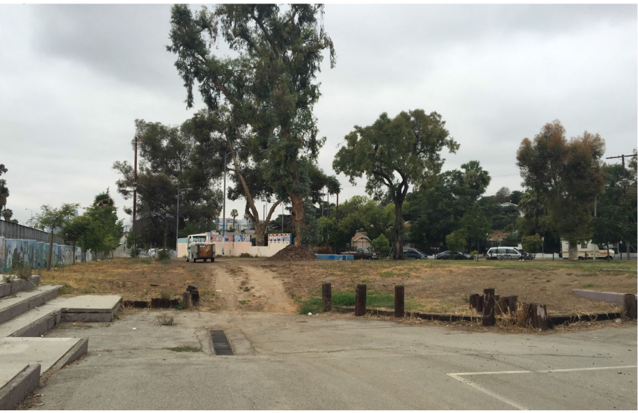
Project site, west entry at Murchison Street