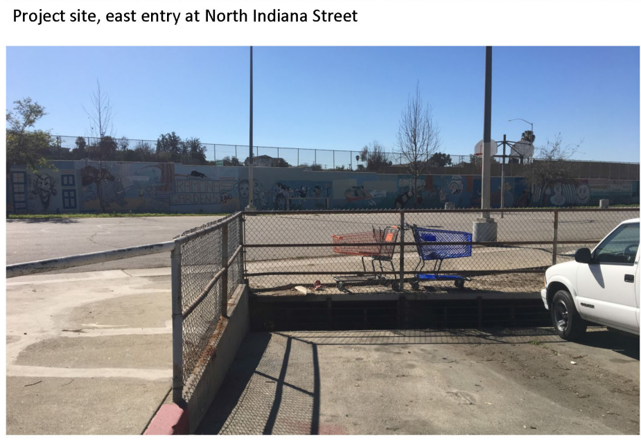
Catch basin drains runoff into storm drain under project site