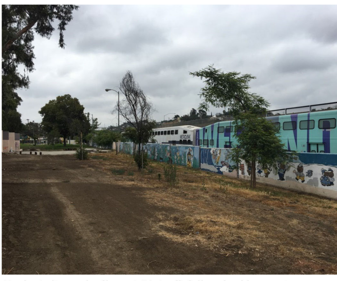
Project site and adjacent Metrolink line, looking east